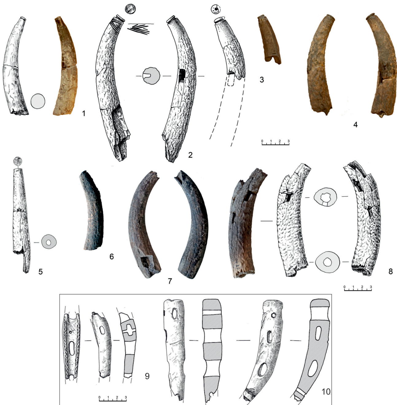
Fig. 3. Cheekpieces from Tell Galabovo (1–8) and Belokopitovo (9–10) (after LESHTAKOV 2021).