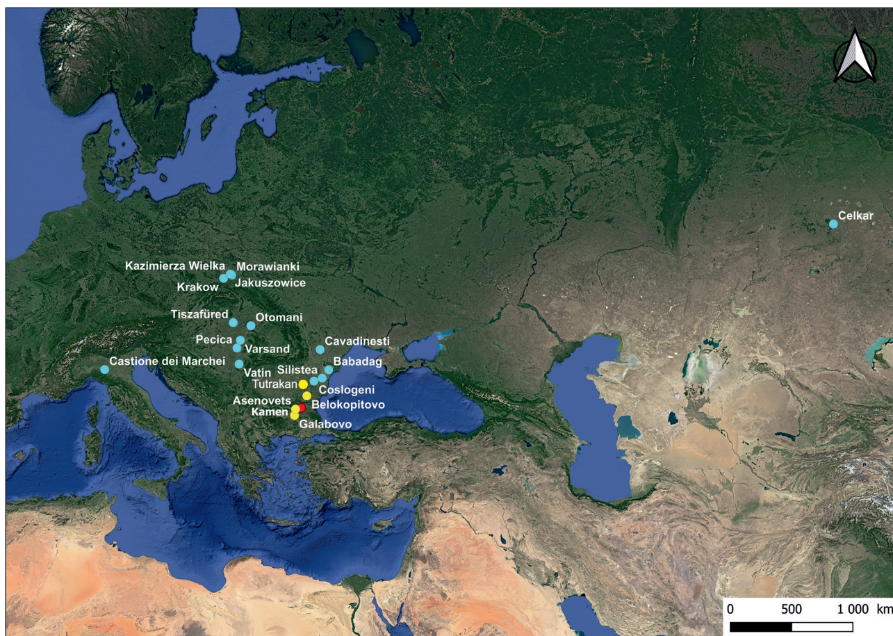
Fig. 1. Map of distribution of the cheekpieces (Asenovets, Tell Galabovo, Belokopitovo, Tutrakan: yellow points. – Finds from Kamen: red point) from present-day Bulgaria, and their parallels (blue points) (Map: D. Sandeva).